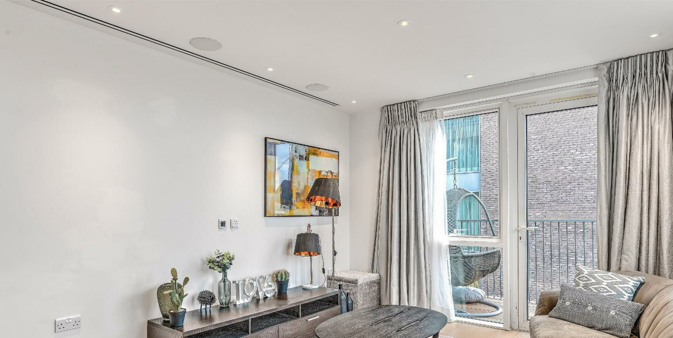
Lockside House, Chelsea Creek Fulham SW6